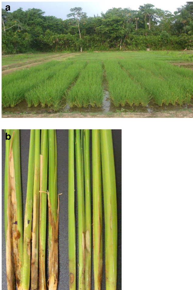
Fig. 1 Irrigated rice field experiment under tropical environmental conditions, favorable to sheath blight development ( a ). Rhizoctonia solani damage on untreated rice plants ( left ) or treated with Trichoderma asperellum , under field conditions ( b )

The genus Trichoderma (Hypocreales, Ascomycota) is known for its antagonistic activity against several plant pathogens, including R. solani (Harman 2006). There are many studies reporting that biological control with Trichoderma may be effective in minimizing the incidence of sheath blight in rice (Das and Hazarika 2000; Tewari and Singh 2005; Naeimi et al. 2010). However, most of them were performed in vitro and in the greenhouse (Naeimi et al. 2010) and only few reported efficiency under field conditions considering method of application in the plant (foliar spray or treatment of seed) and formulation. The main objective of this study was to develop an effective method of applying Trichoderma spp. for controlling sheath blight in rice under flooded conditions.